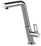
Mixer Tap KE 8492 000