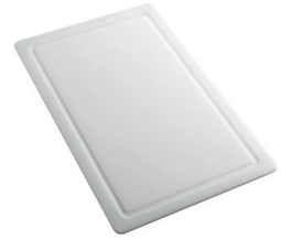
HDPE Chopping board 8657 001